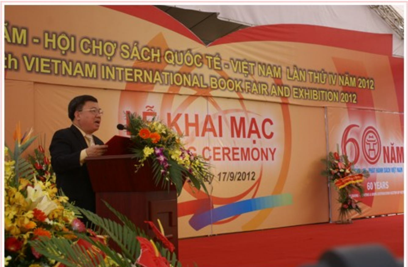
The NLV joins in Vietnam International Book Fair - Exhibition IV – 2012 and the 60-year Celebration of Vi