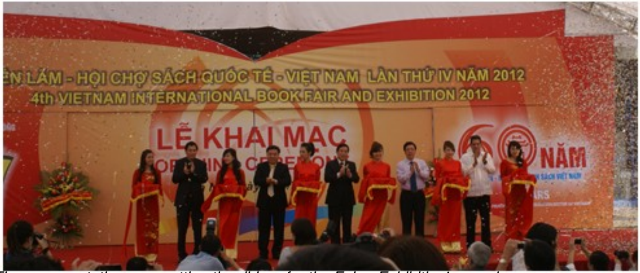
The representatives are cutting the ribbon for the Fair – Exhibition's opening ceremony