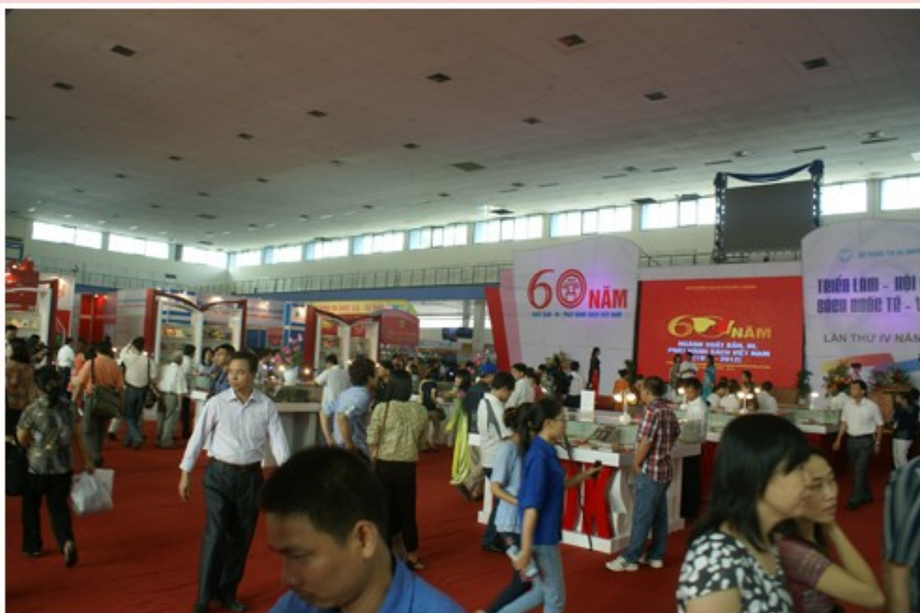
Numerous readers visit the NLV's booth which is located at the center of the Fair – Exhibition