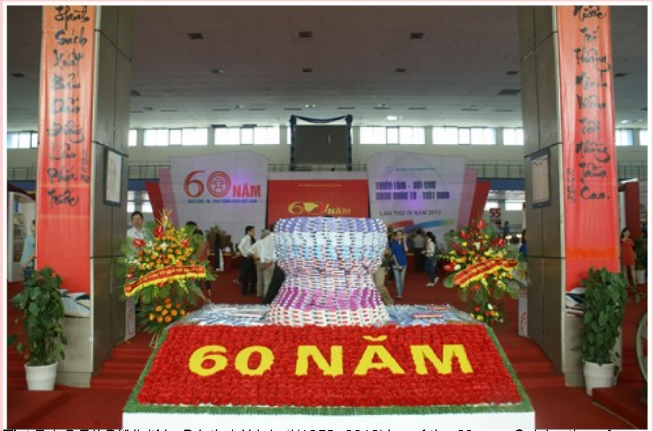
Vietnam Book Publishing Industry (1952-2012) in the occasion of the 60-year Celebration of