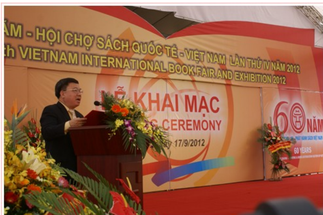
The NLV joins in Vietnam International Book Fair - Exhibition IV – 2012 and the 60-year Celebration of Vi