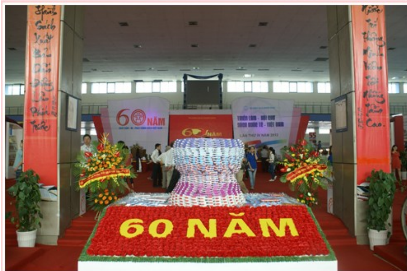
Vietnam Book Publishing Industry's 60th Anniversary (1952-2012) Exhibition of the 60-year Celebration of