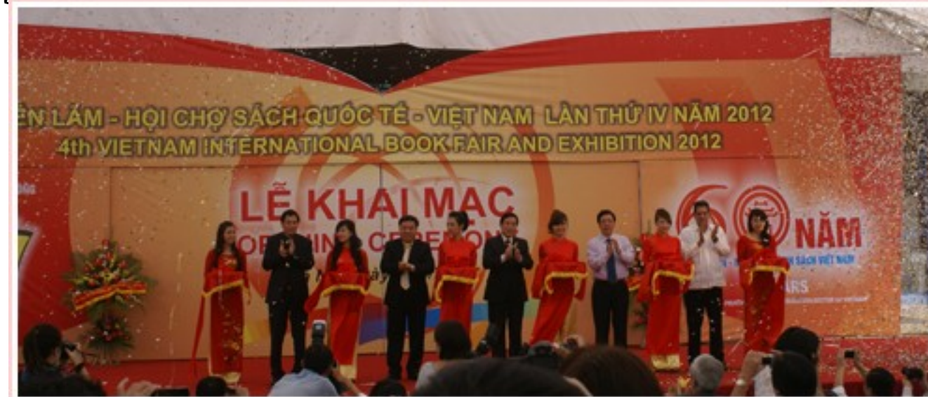
The representatives are cutting the ribbon for the Fair – Exhibition's opening ceremony