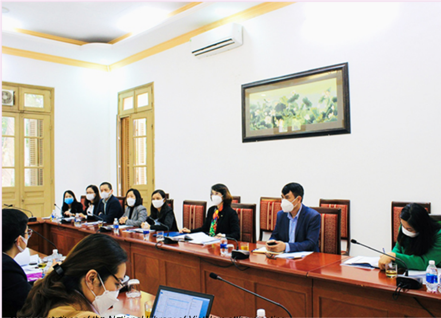
News and Photos of the National Library of Viet Nam at the meeting