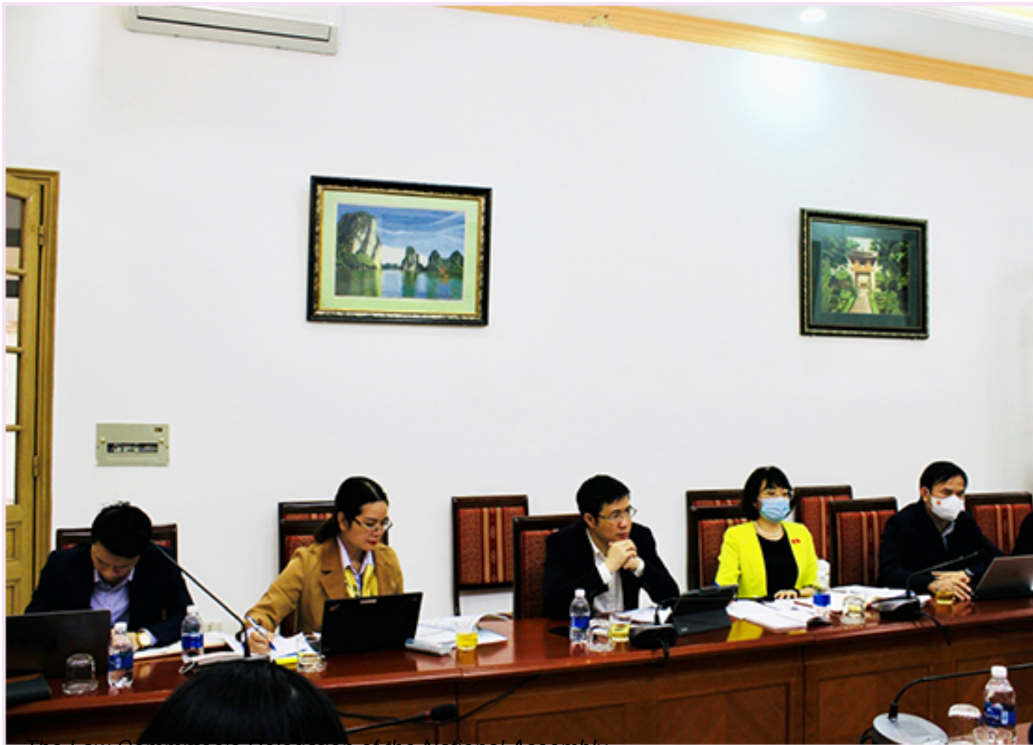
The Law Committee's Delegation of the National Assembly