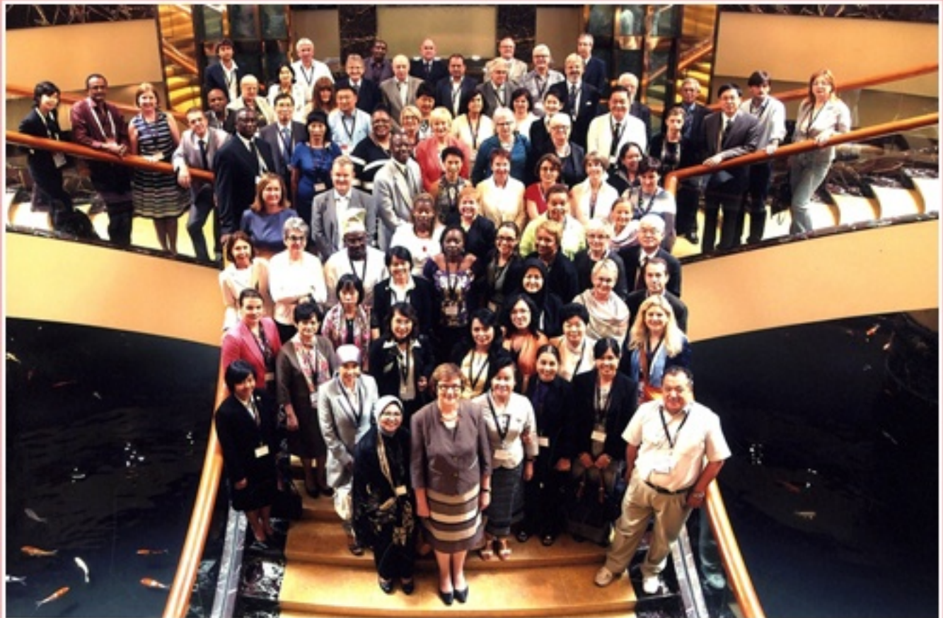
CDNL Annual Meeting 20 August 2013, Singapore

(CDNL 2013) Library of Viet Nam's delegates at the Conference of Director of National Libraries