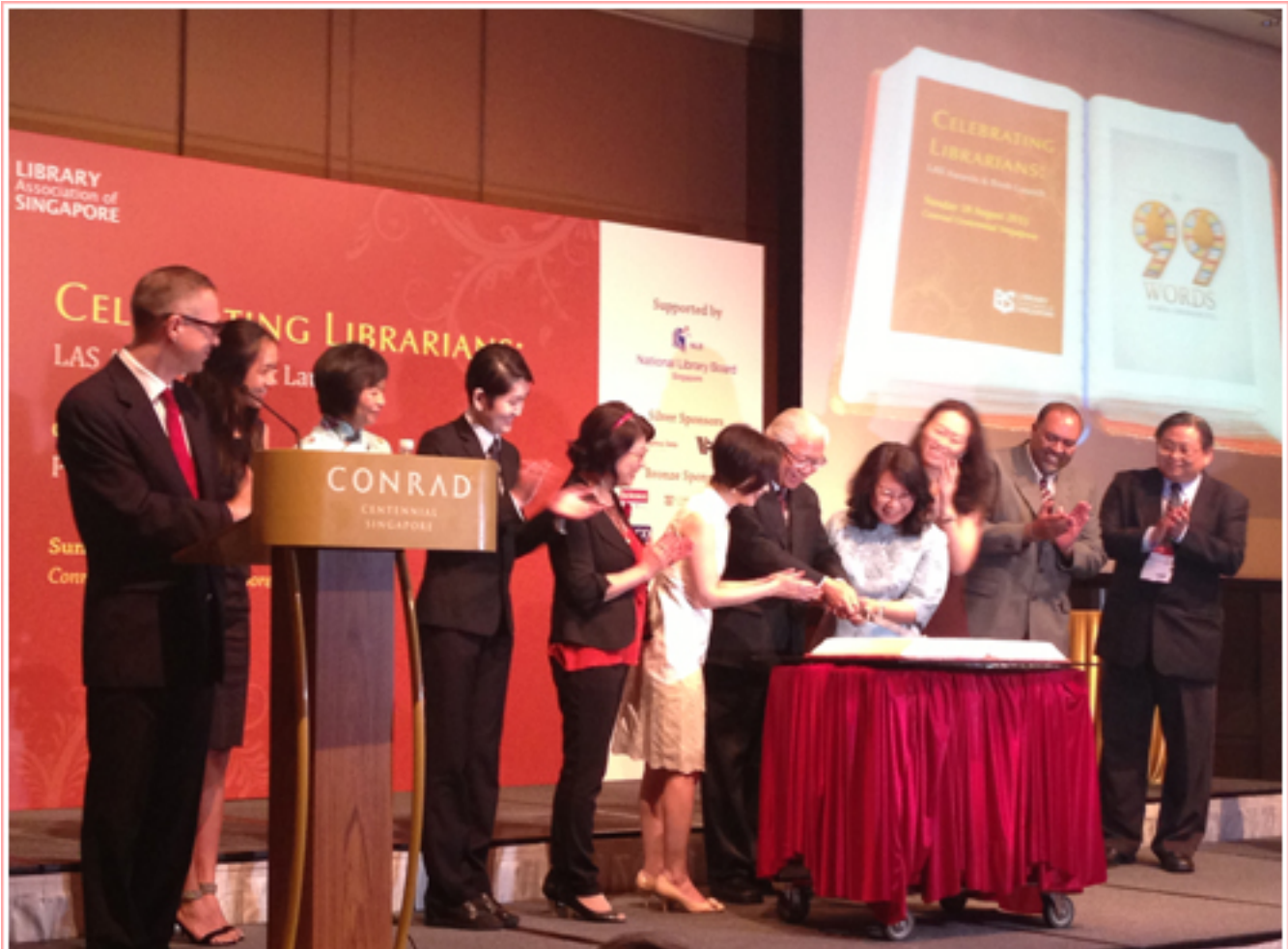
Library Association of Singapore, 2013.