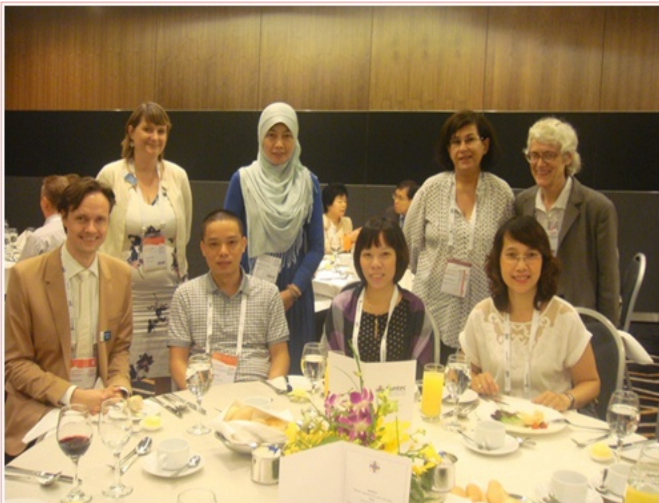
Members of the Malaysian Library Association, Singapore Chapter, and the Singapore Library Association, Singapore Chapter, at the IFLA WILIC 2013, Singapore, 2013.