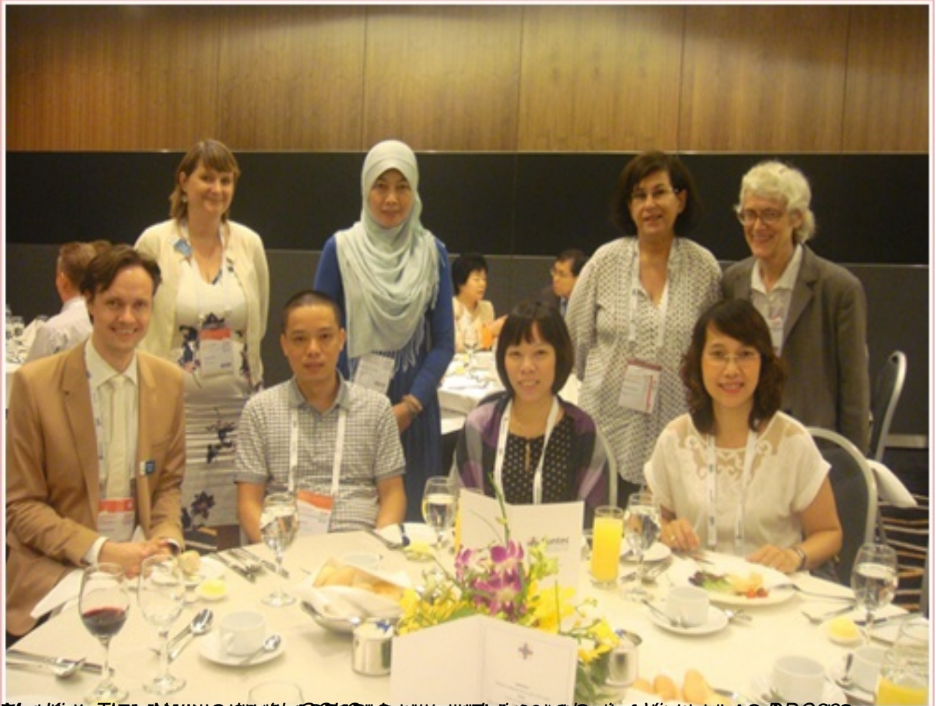
Members of the National Library of Singapore, Singapore, and the Singapore Library Association, Singapore, at the opening ceremony, 2013.