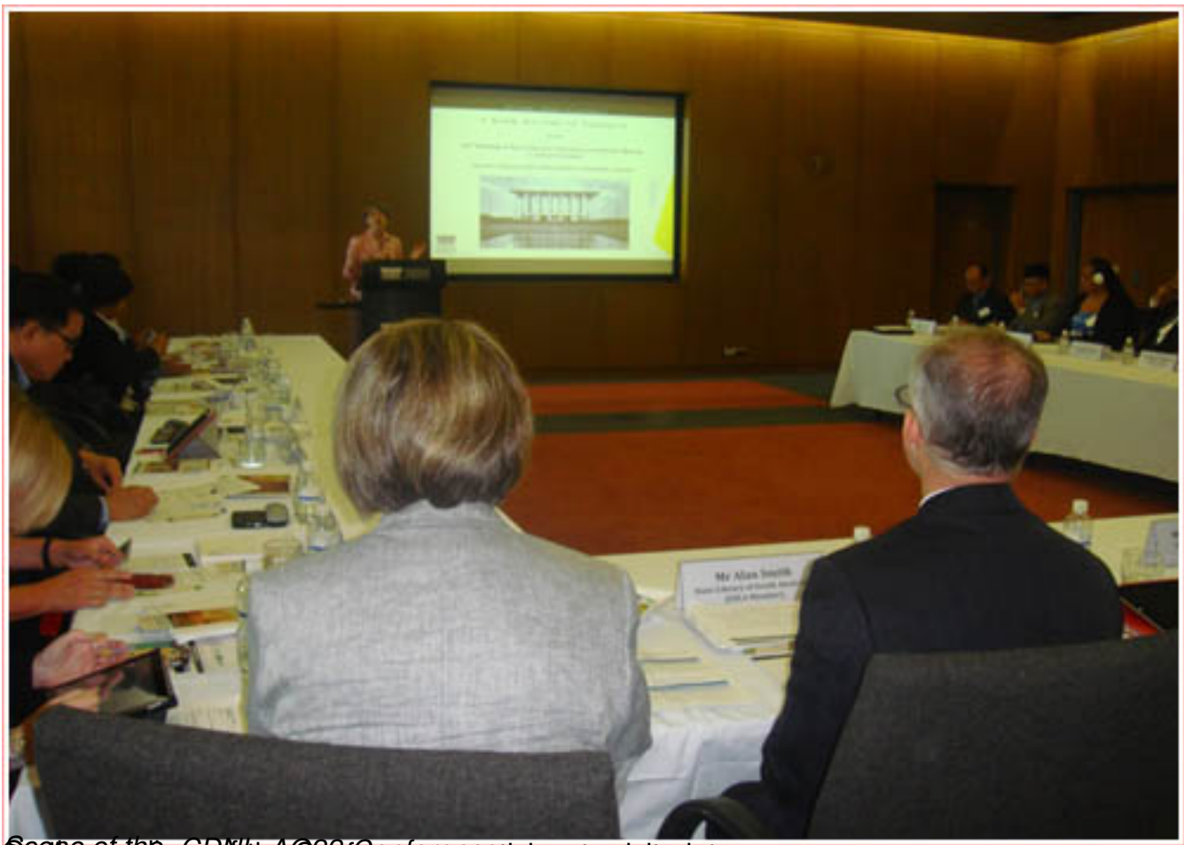
Sector of Australia, the National and Gallery of Australia,