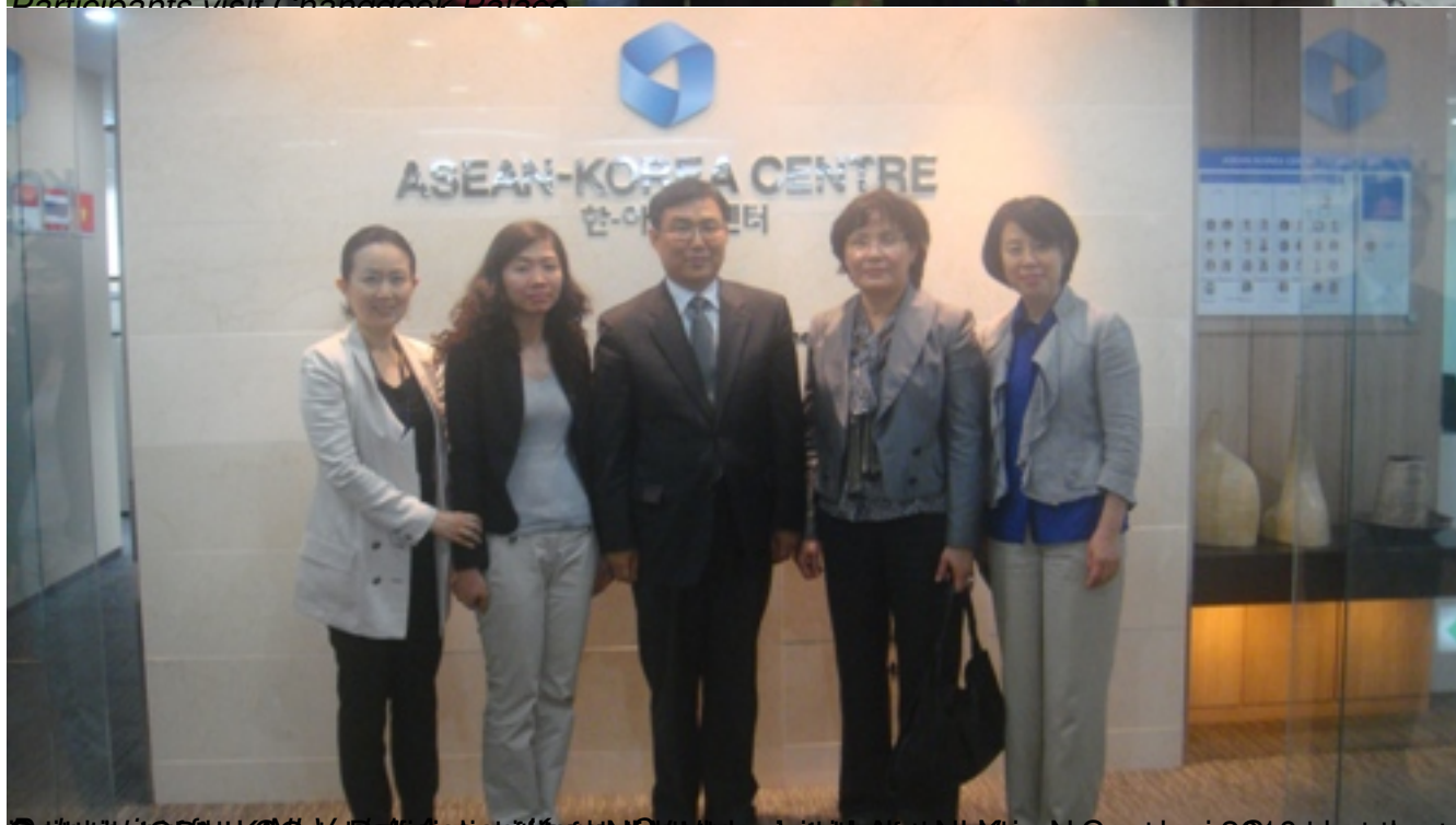
Participants visit the ASEAN-Korea Centre in Seoul, Korea