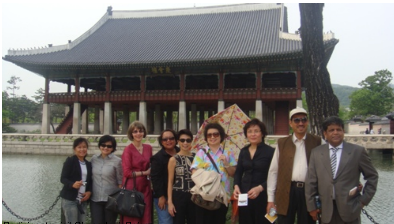
Participants visit Changdeok Palace