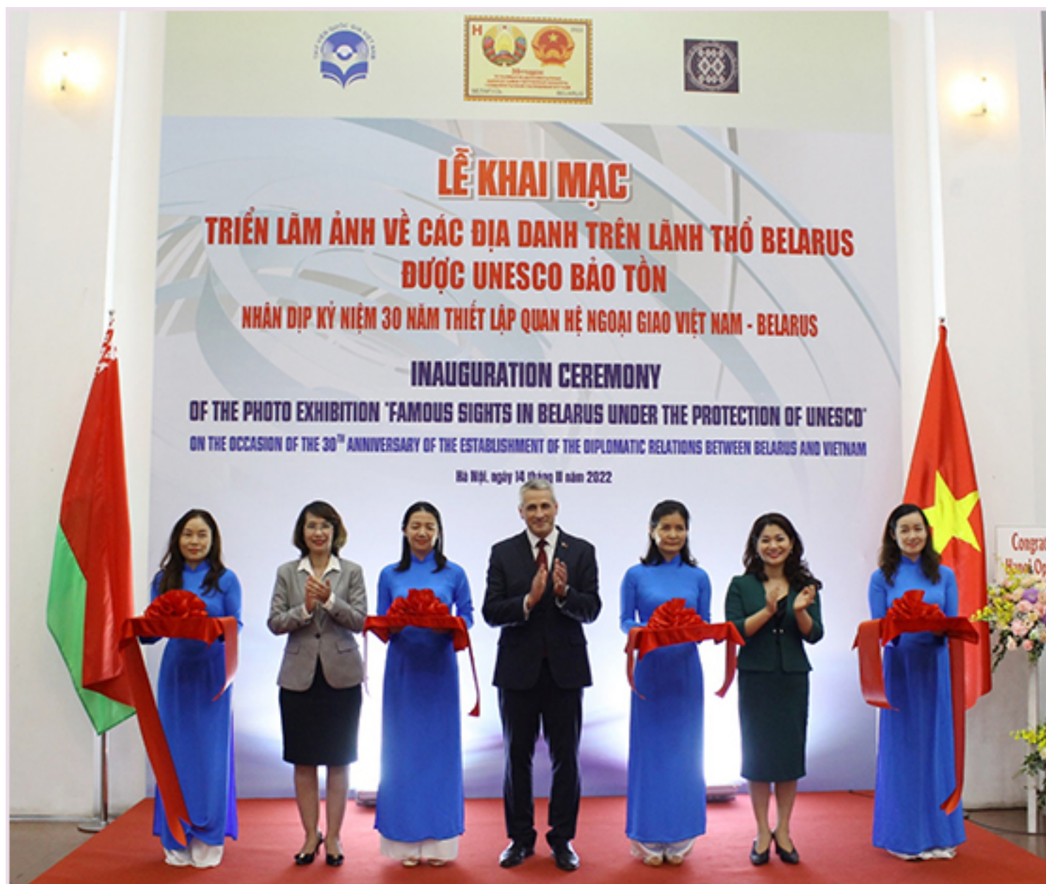
UNESCO cutting to open the Photo exhibition Famous sights in Belarus under the protection of