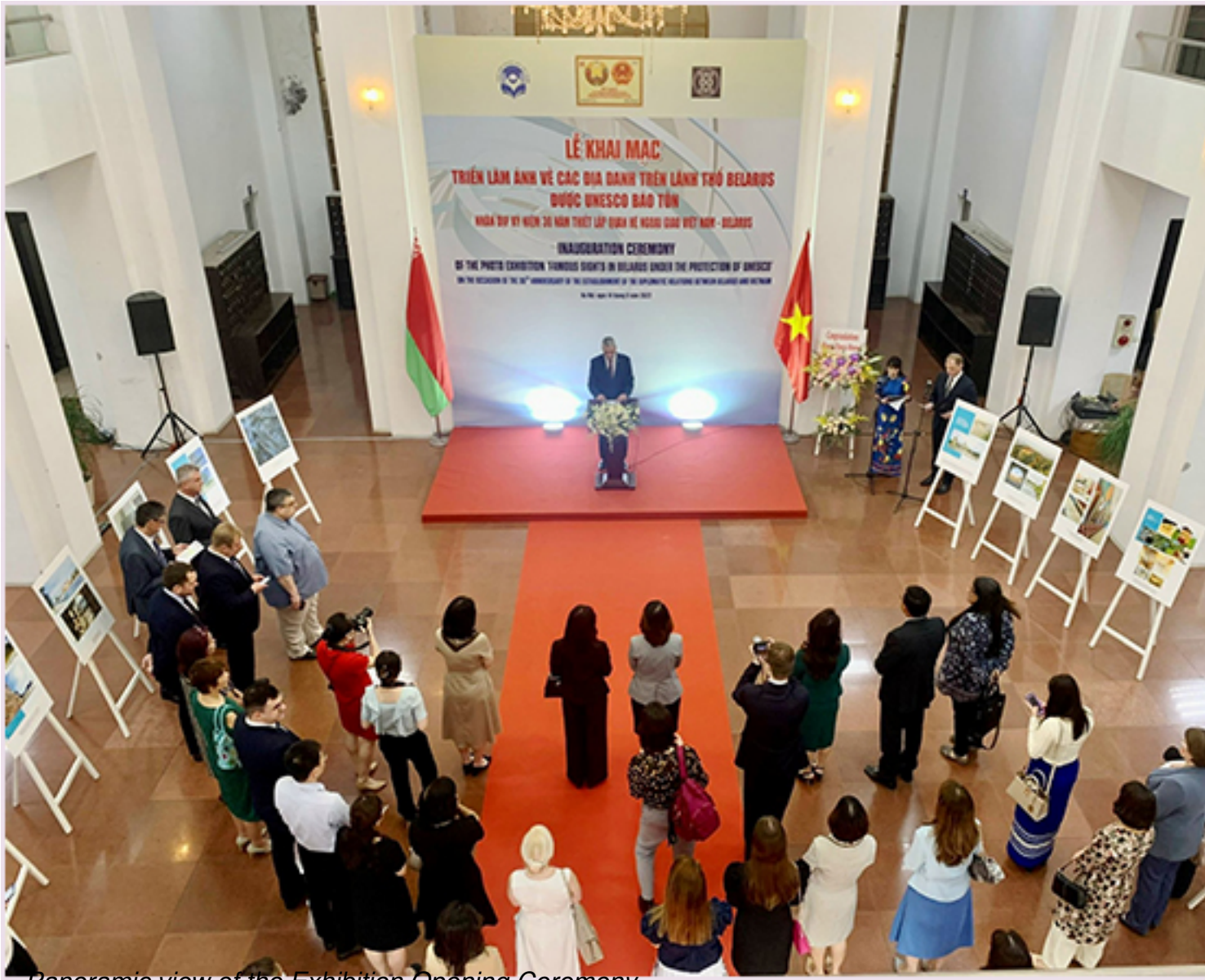
Panoramic view of the Exhibition Opening Ceremony