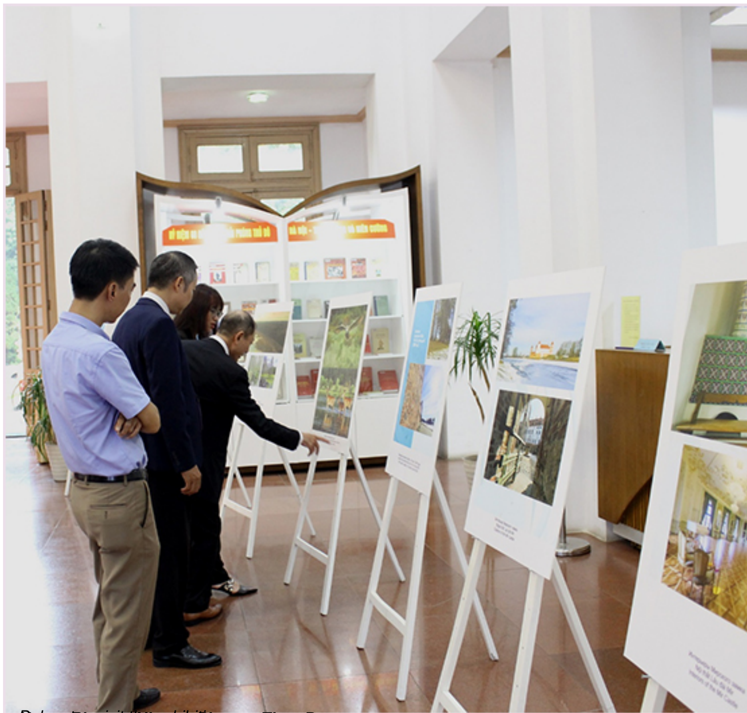
News at Phuong Minh, Ph News at Phuong Minh, Ph