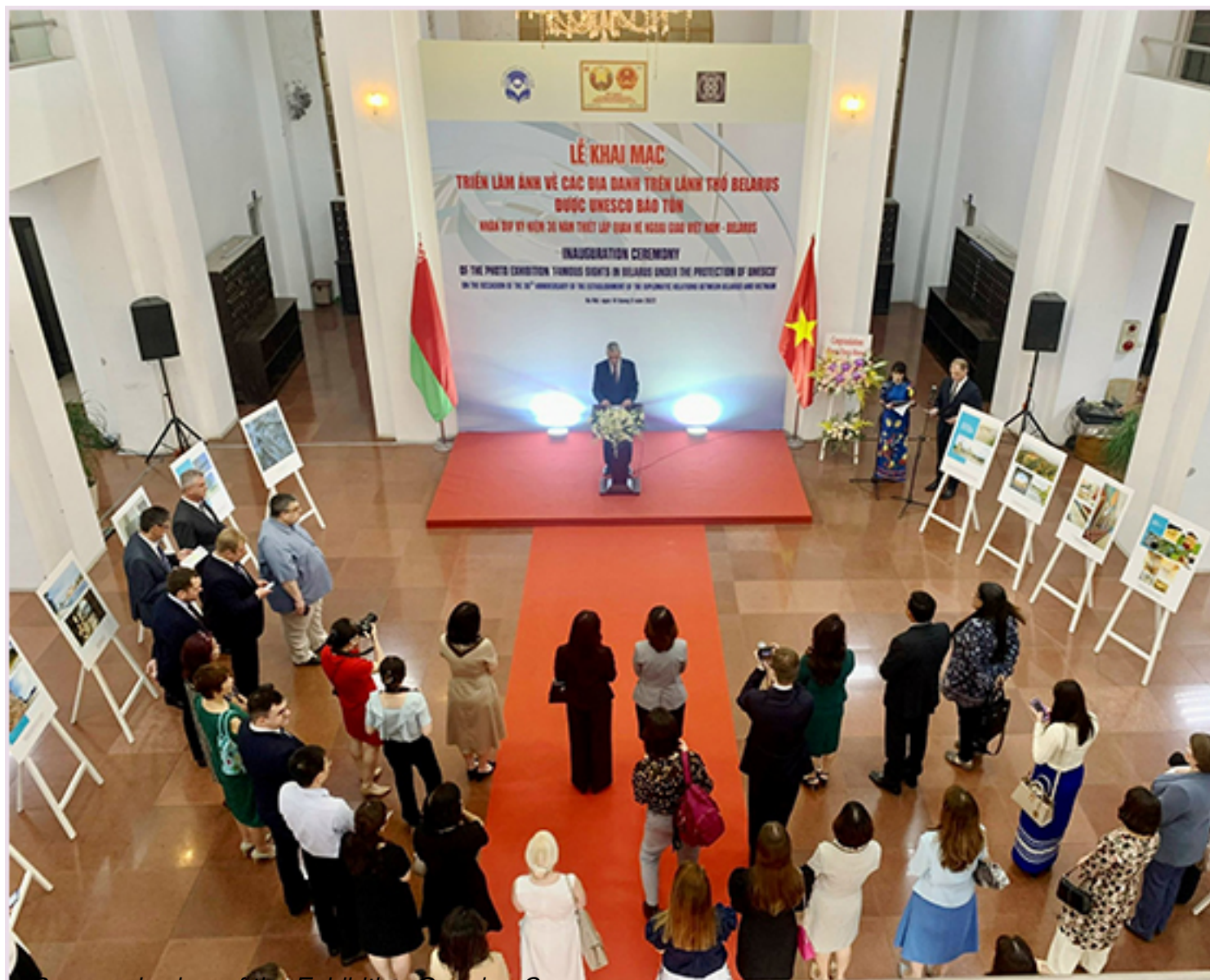
Panoramic view of the Exhibition Opening Ceremony