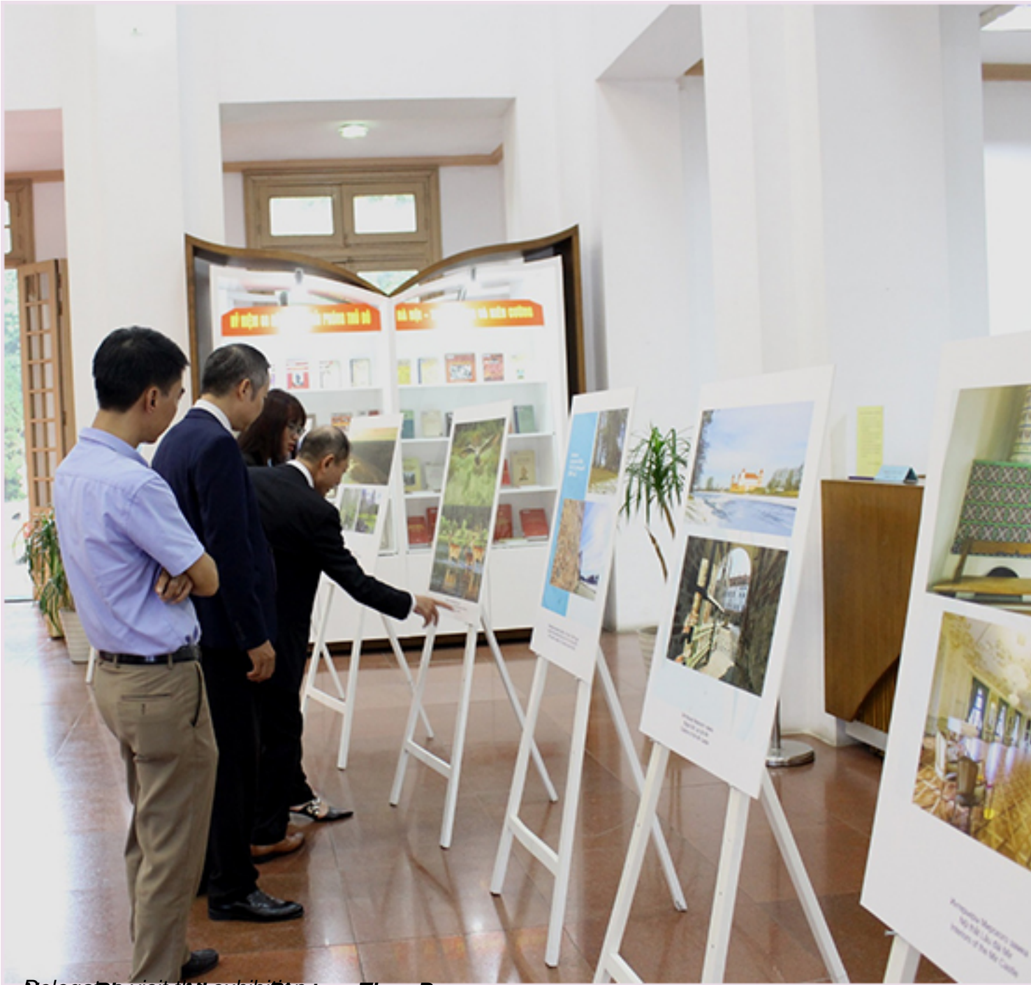
News at Phuong Minh