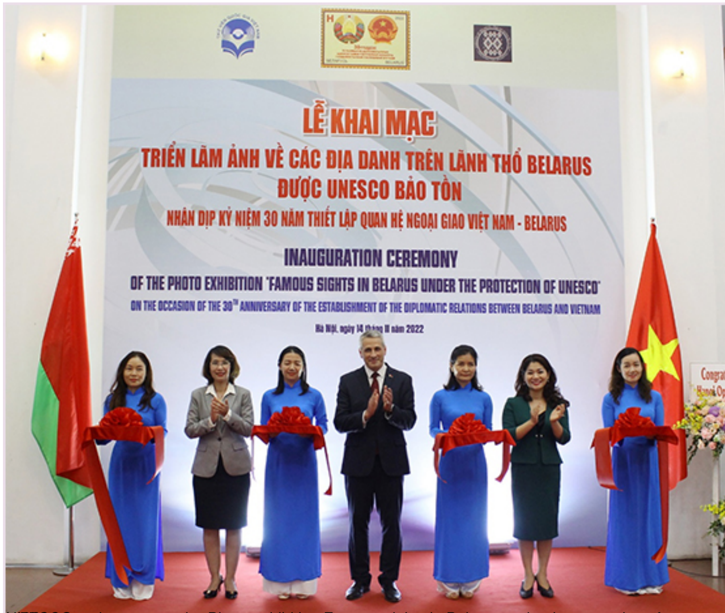
UNESCO cutting to open the Photo exhibition Famous sights in Belarus under the protection of