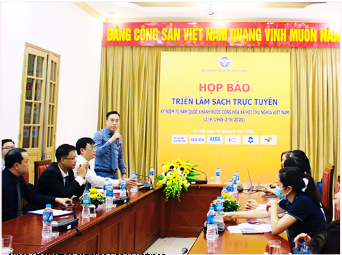
News: Dang Dung