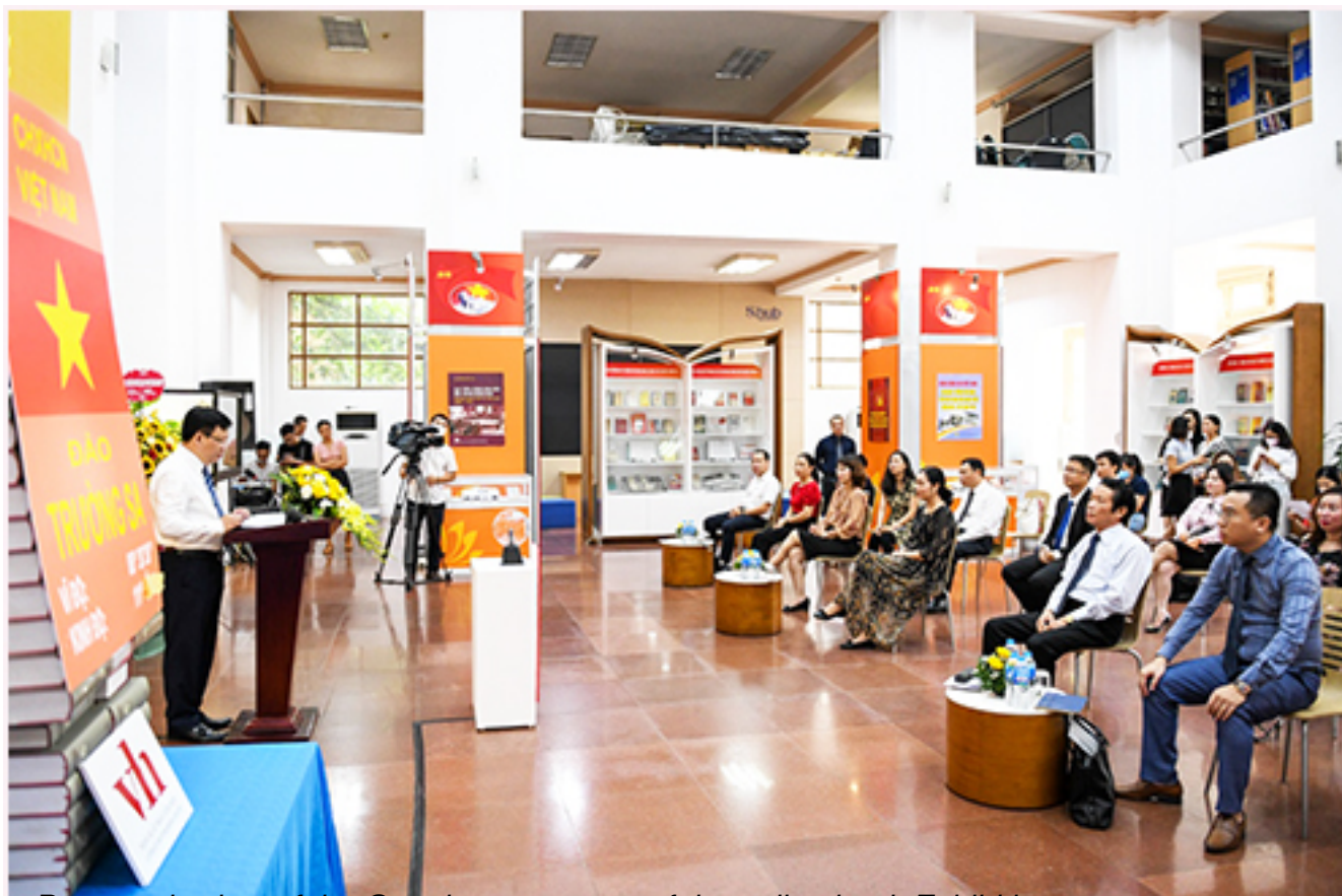
Panoramic view of the Opening ceremony of the online book Exhibition