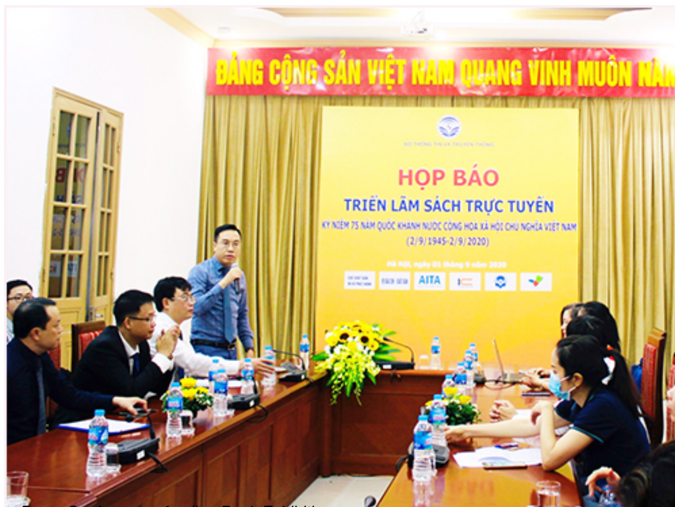
News: Dang Dung