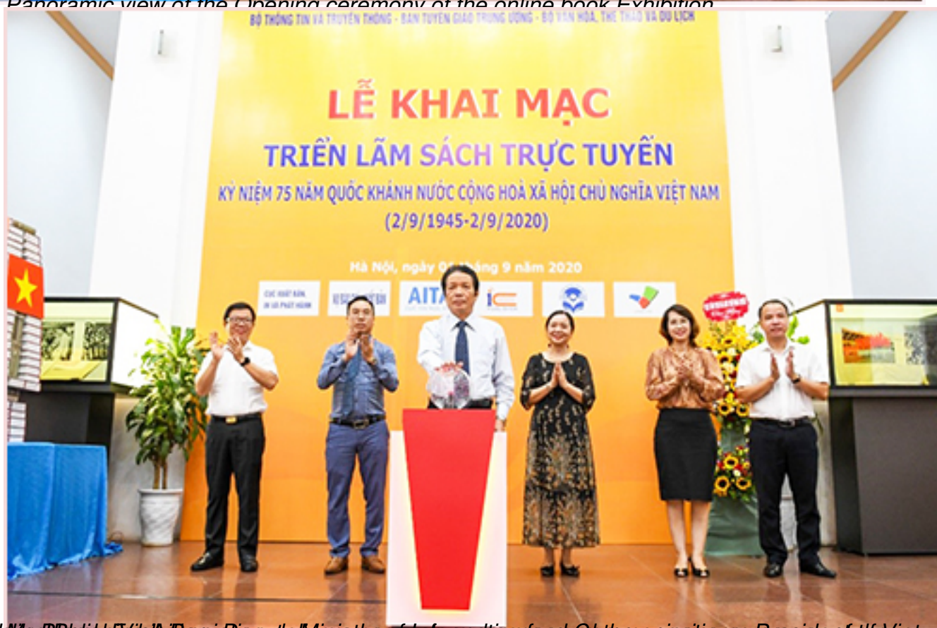
Minister of Culture, Sports and Tourism, Deputy Ministers of Education and Training, and other operations, President of the Viet Nam Publishers Association