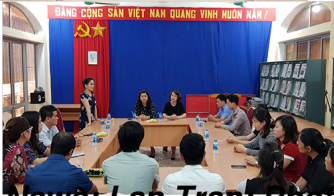
News: Lan Tran