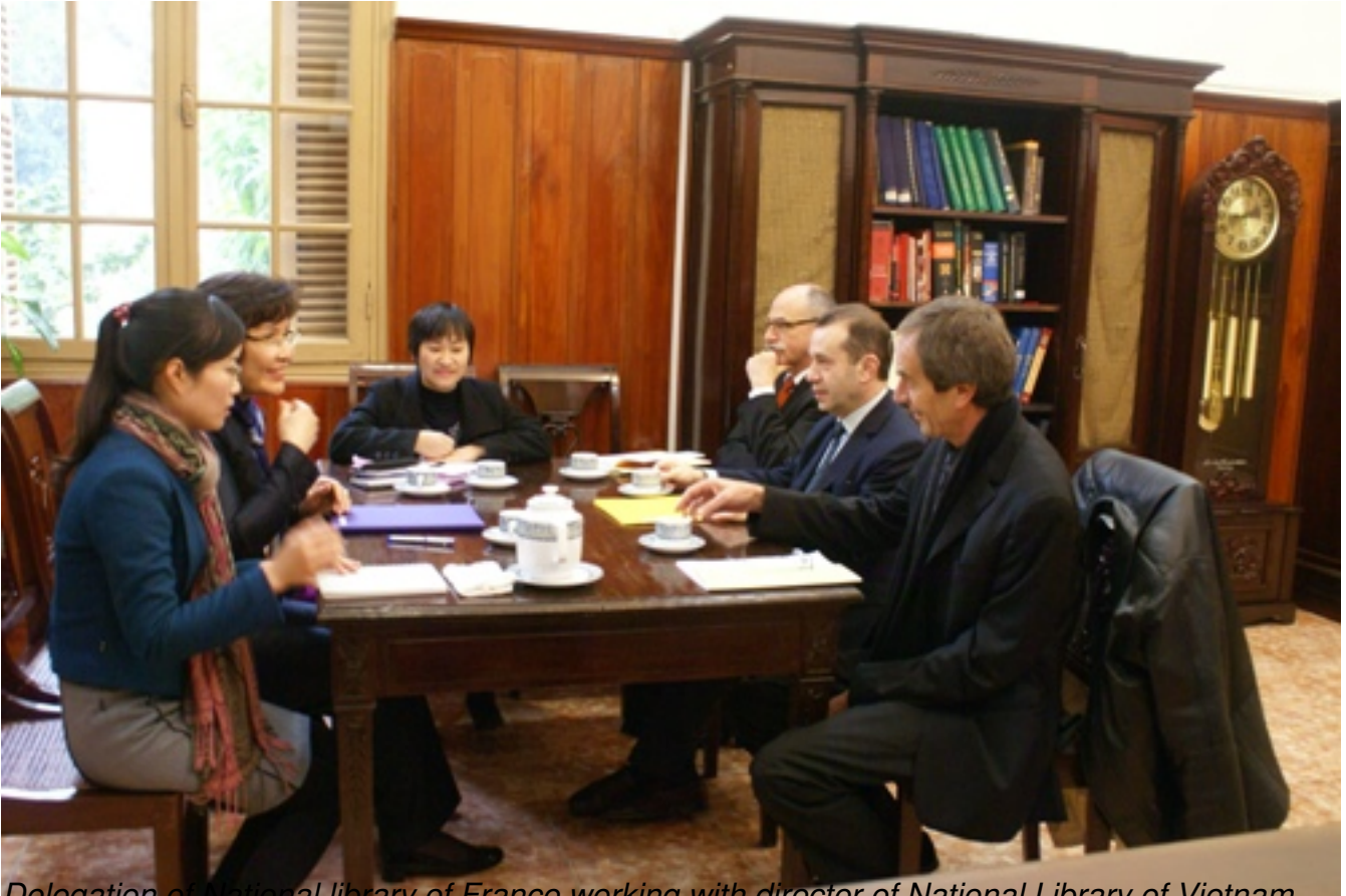
Delegation of National Library of France working with director of National Library of Vietnam