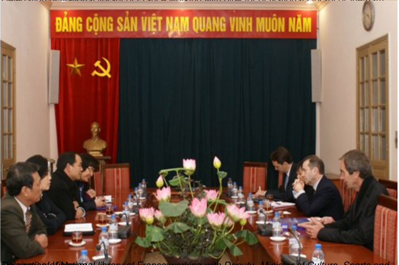
Delegation of National library of France working with Deputy--Minister of Culture, Sports and