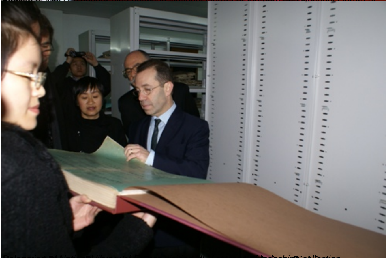
News and Photos Photo by Dan, a source of the magazine Relations Division