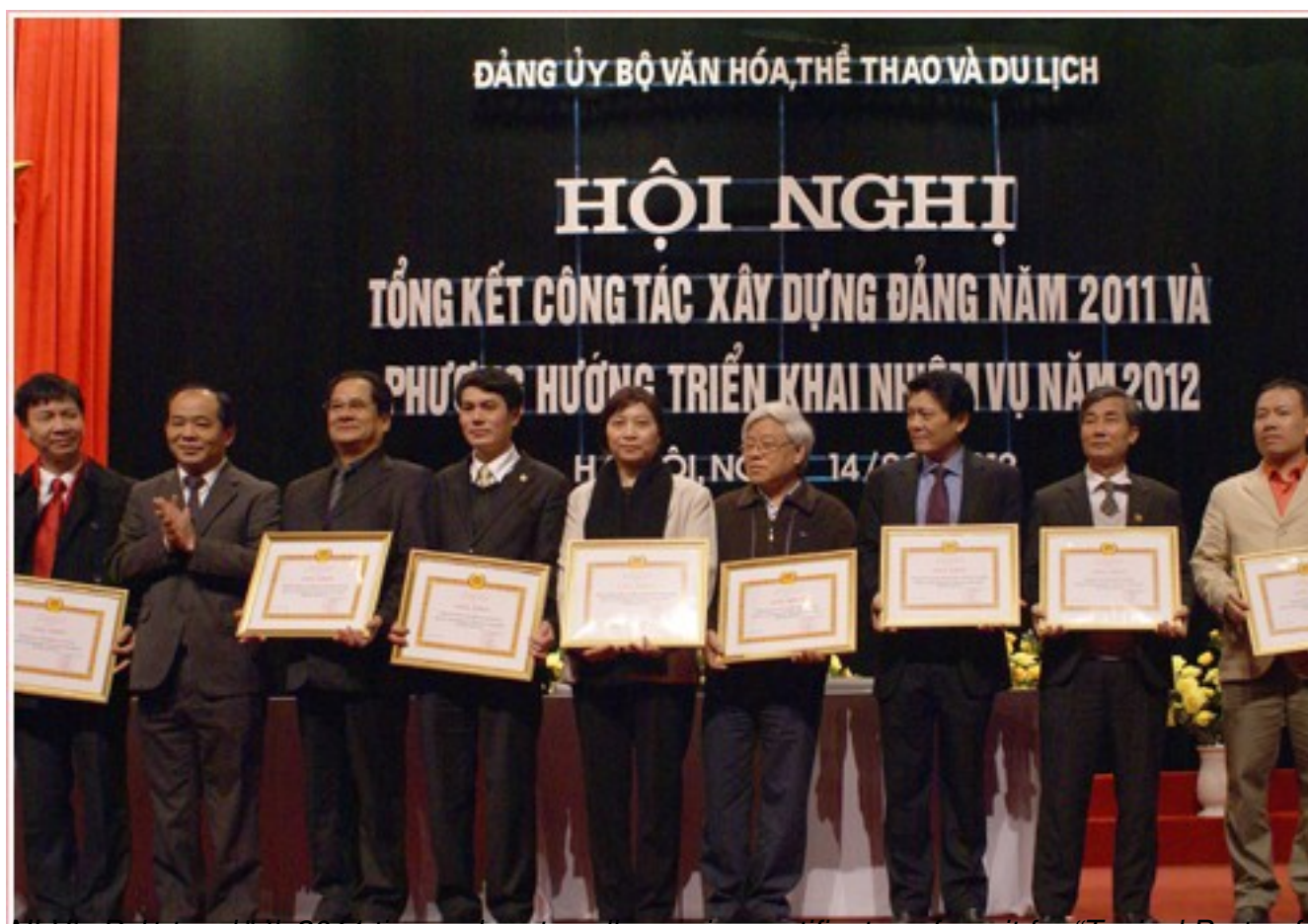
Text, photos, and video of the award ceremony and party cells receive certificates of merit for "Typical Party of