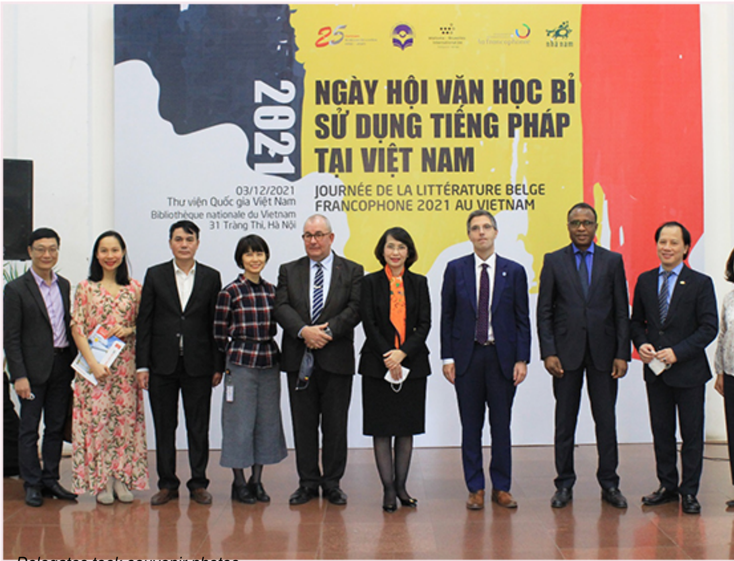
Delegates took souvenir photos