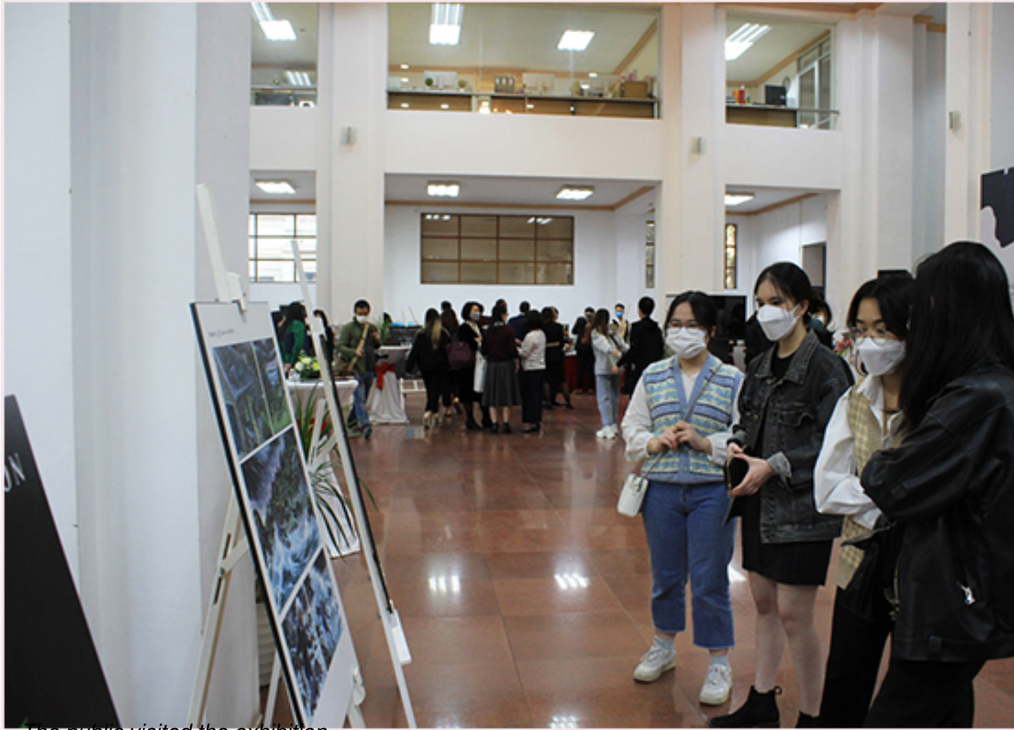
The public visited the exhibition