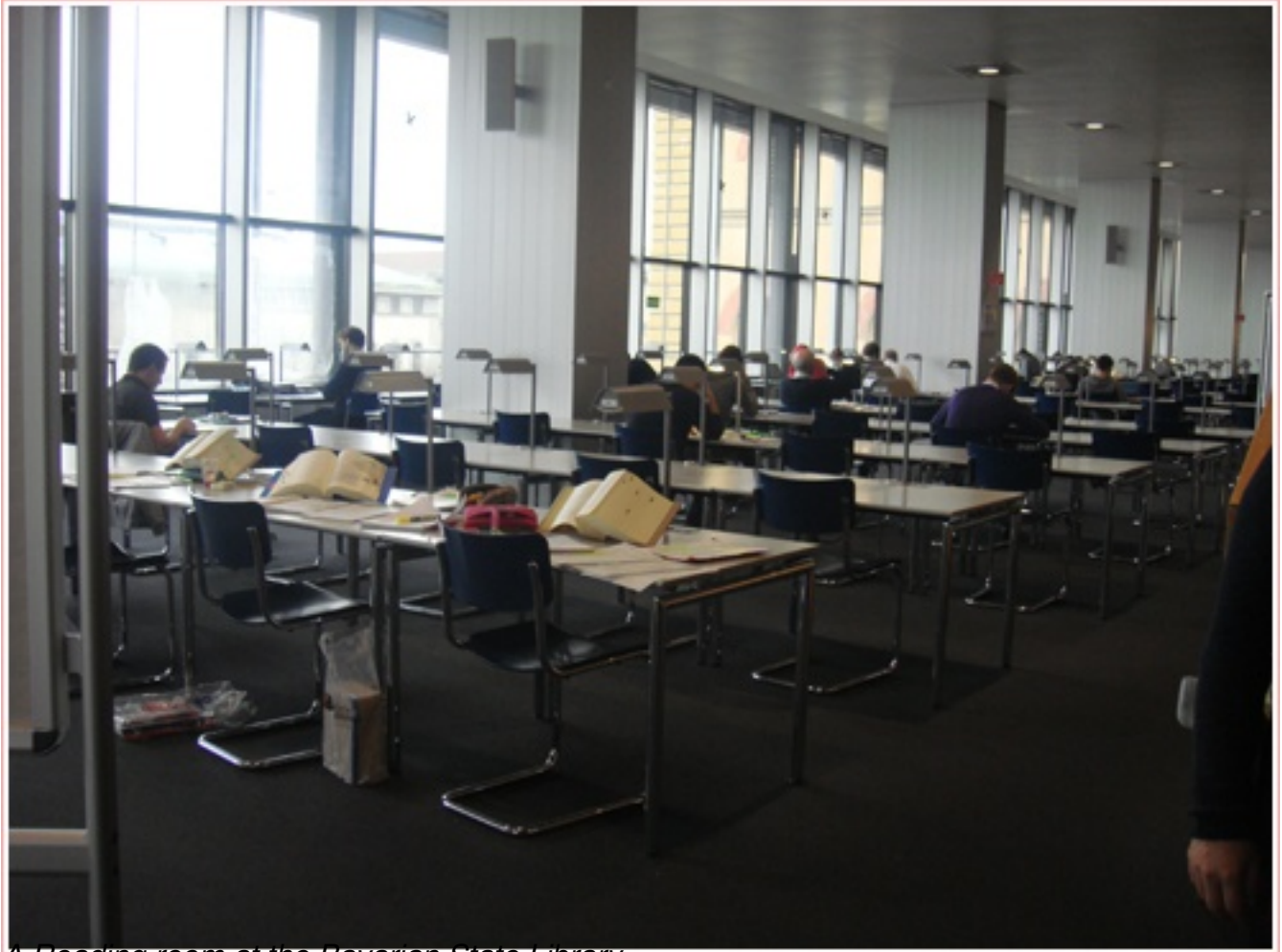
A Reading room at the Bavarian State Library