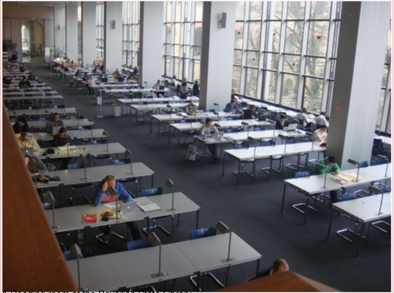
A Reading room at the Bavarian State Library