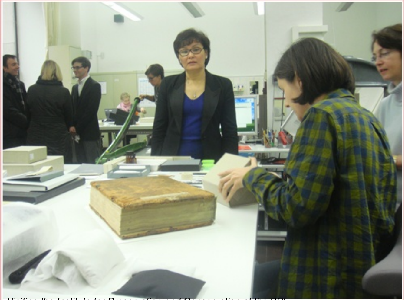
Visiting the Institute for Preservation and Conservation at the BSL