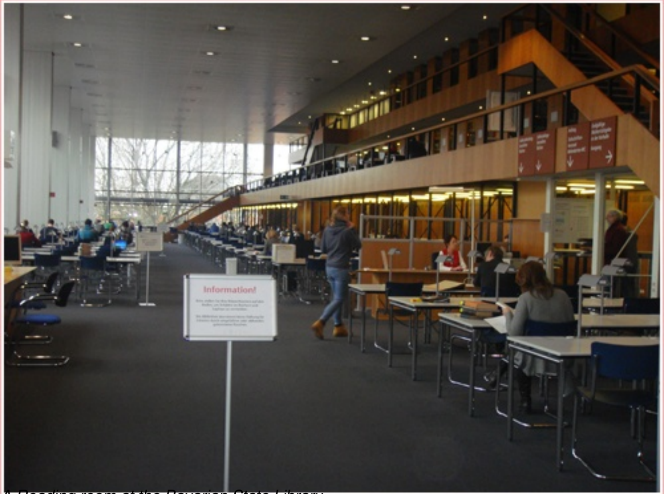
A Reading room at the Bavarian State Library