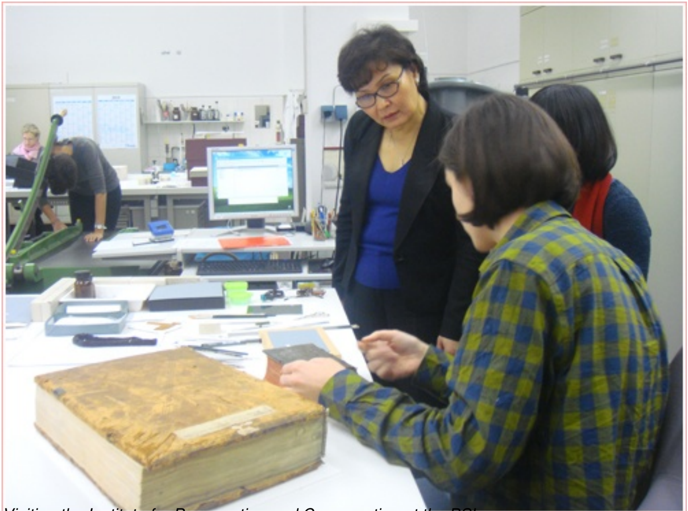
Visiting the Institute for Preservation and Conservation at the BSL