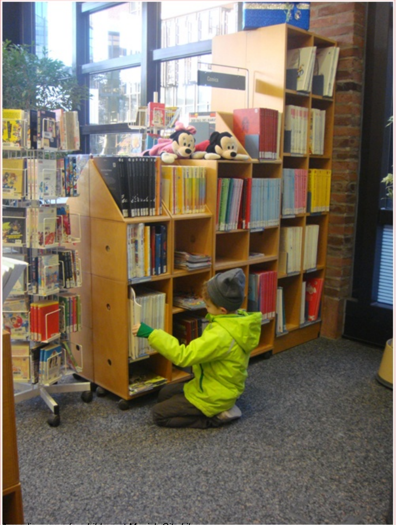
A reading room for children at Munich City Library