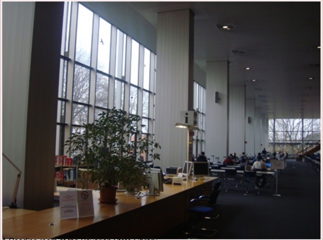
A Reading room at the Bavarian State Library