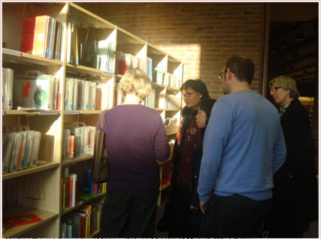
Visiting the reading room of tape – disk and books at Munich City Library