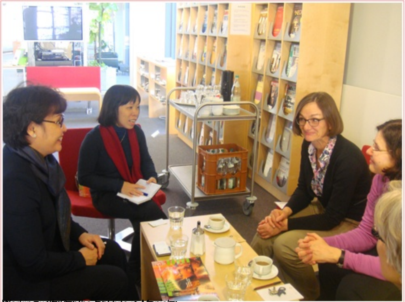
News: With Photo , Photos: Le Duc Thang □ □ □ □