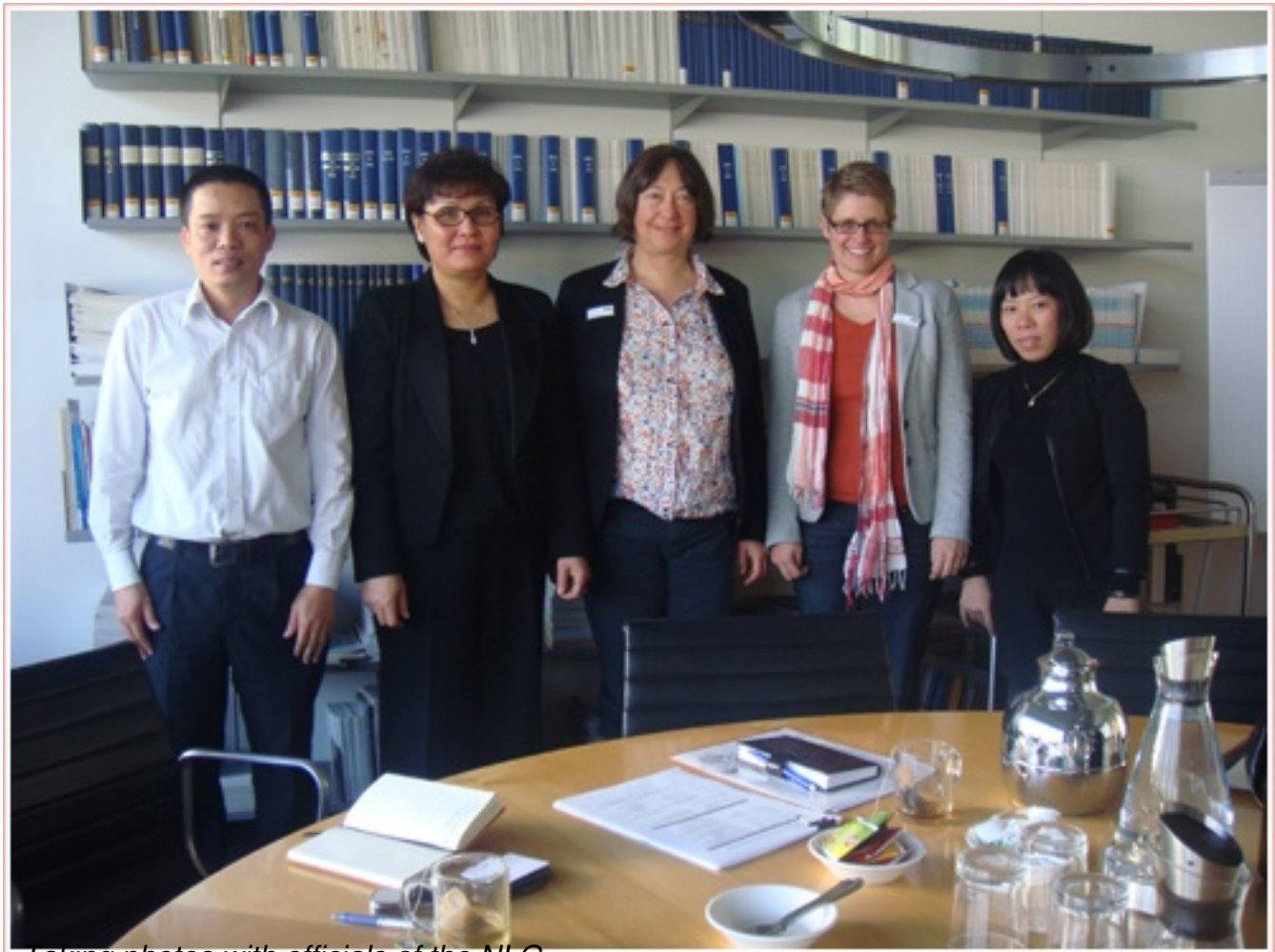
Taking photos with officials of the NLG