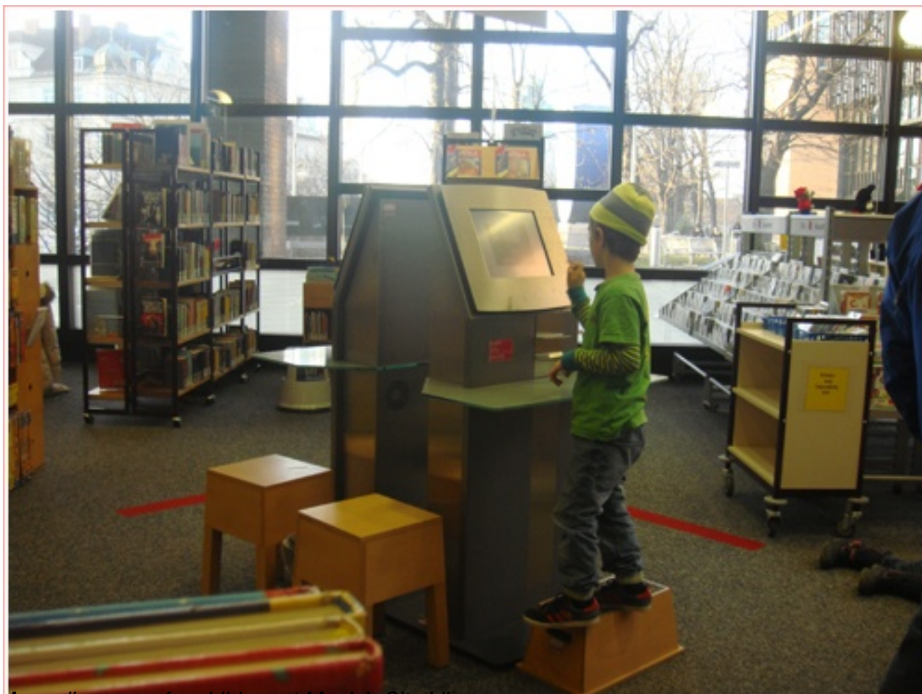
A reading room for children at Munich City Library