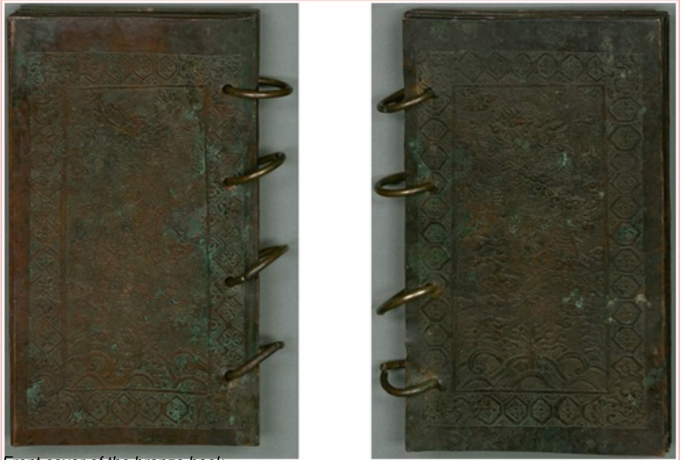
Front cover of the bronze book