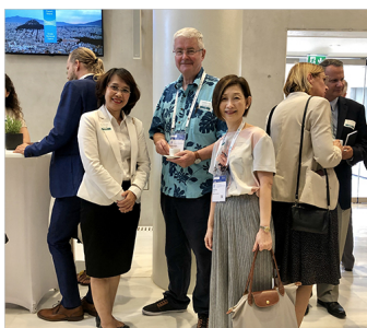
Meeting and exchanging with international library colleagues