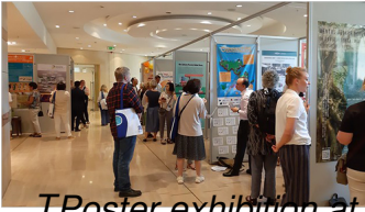
Poster exhibition at the 85 th IFLA Congress