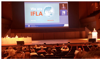
Some sessions of the Congress