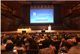
News and photos ONLY 85 th IFLA Congress