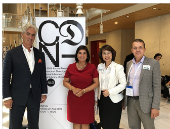
Meeting with IFLA President and General Secretary