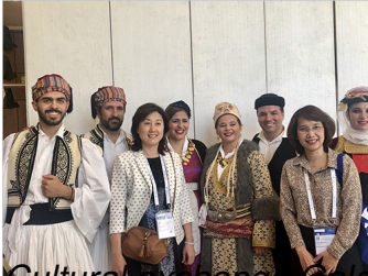
Cultural evening in Athens