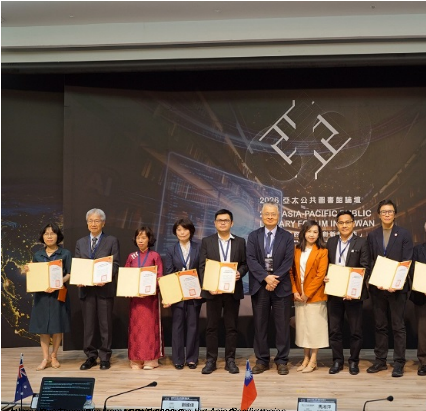
News Bureau Photos APPLF 2026 Organizing Committee