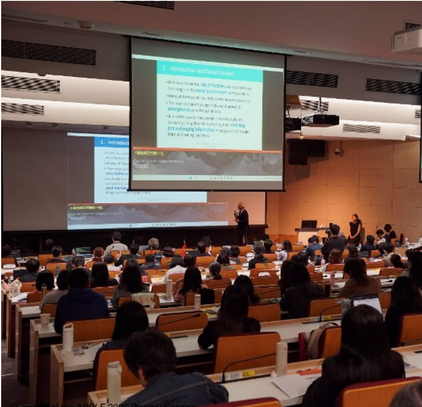
Overview of the APPLF 2026 Plenary Session