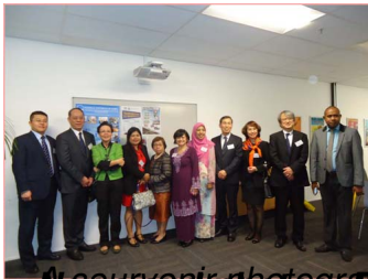
News and photos from the day