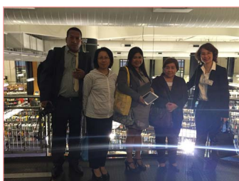
Visiting Wellington City Library