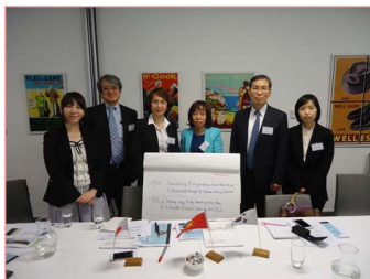
Group discussion within the seminar