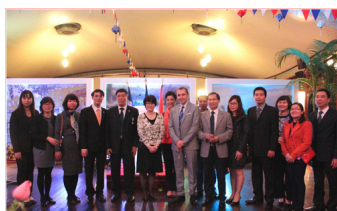
Souvenir photograph with officials from NLV